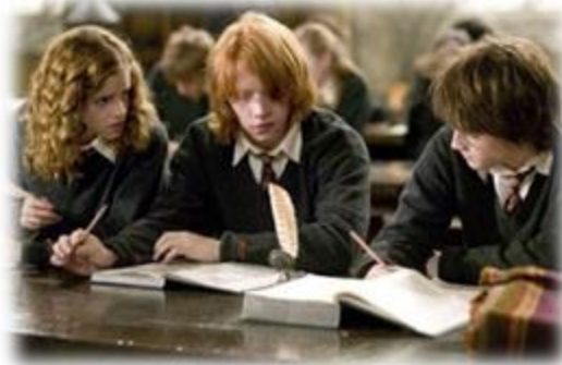
Harry Potter (Durham)