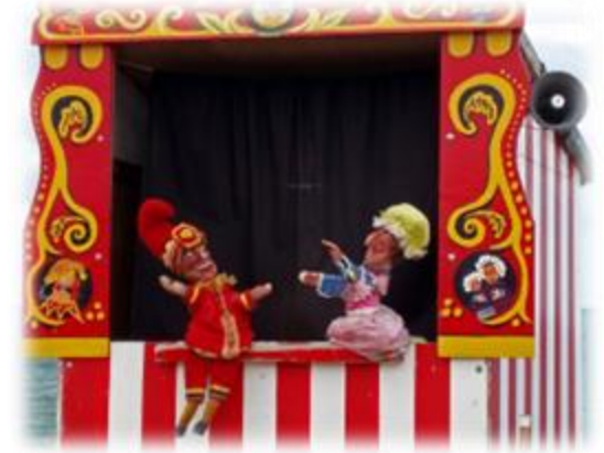
Puppetry (Nottingham Trent)