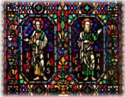
Stained Glass (York)