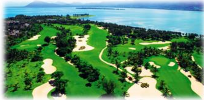
Golf course management (Birmingham)